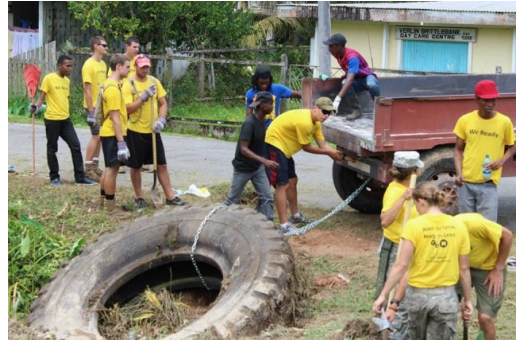
U.S. Army ROTC Cadets participated in a community service event in Linden, Guyana. The Cadets were on a Cultural Understanding and Language Proficiency Program mission.

The missions in which the Cadets participate are humanitarian, teaching conversational English, military to military training or a combination of the three. But many of these missions are conducted within the National Guard SPP regions where Cadets augment the National Guard forces for any or all of these type missions -- ultimately enhancing security cooperation.