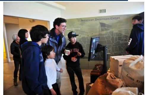
An American Japanese family looks at the exhibits at MIS Historic Learning Center that opened on Veterans Day Nov. 11, 2013