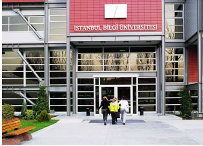
Bilgi University in Istanbul, Turkey

special “perks” associated with being assigned to a Special Forces Command. “Every day is awesome. I love my job. The leadership training is excellent, everyone I work with is great, and what other law firm gets to parachute out of a Blackhawk helicopter into a lake, or shoot on a special operations training range?”