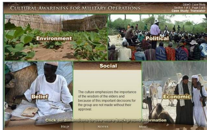
Indiana Cultural Awareness For Military Operations trainer, provides interactive lessons in cultural awareness

"The fact that he learned Korean in 18 months, and Chinese largely through immersion, is a testament to his work ethic," he said. "He enjoys and embraces challenge. He went out and actively sought out the hardest languages to learn." "I can read not only what the