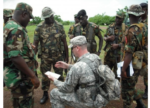
As teams deploy to Africa, they do so with a new awareness of language and culture

"So in cooperation with Joint Knowledge Online (JKO) we decided to create an online trainer that would include the