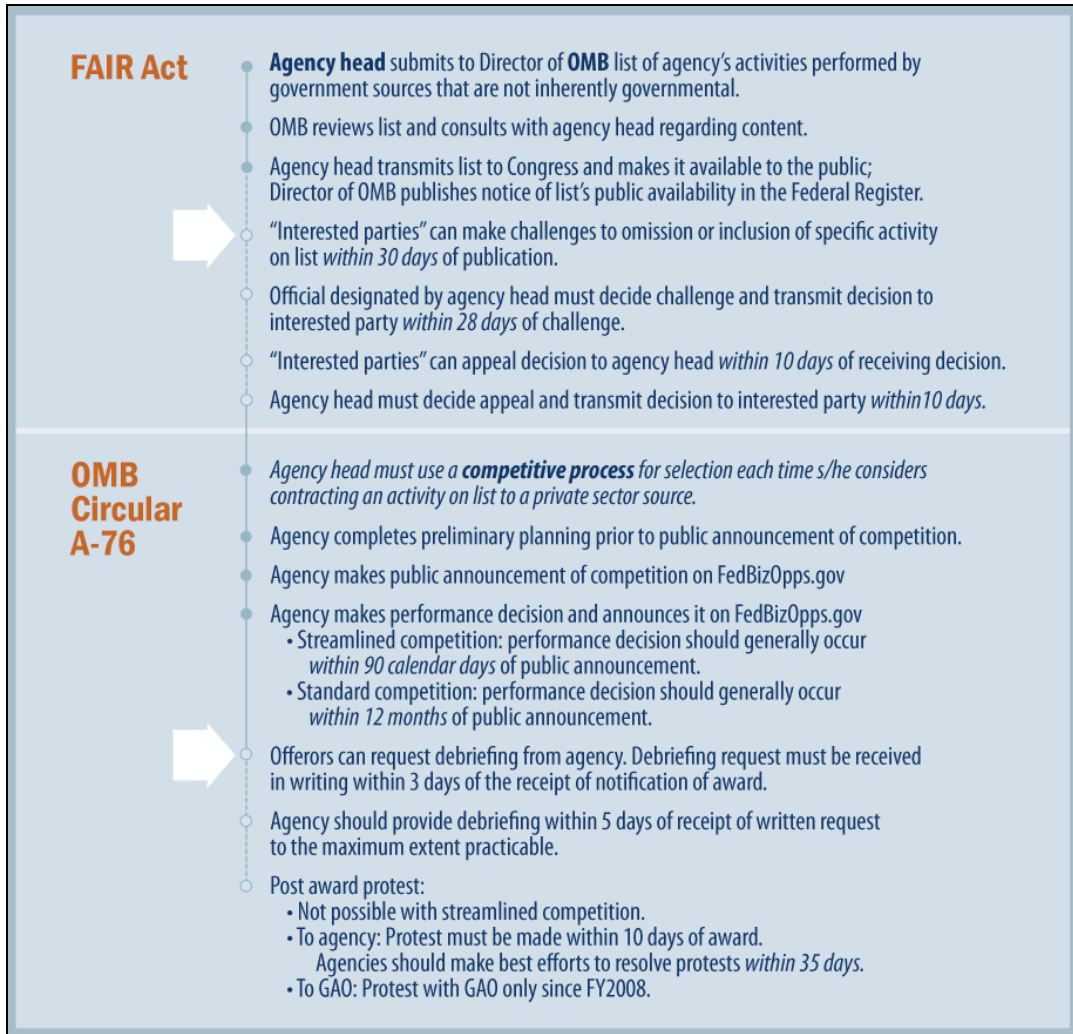
Figure 3. Processes Under the FAIR Act and OMB Circular A-76 Activities That Involve Opportunities for Congressional or Public Notification or Objections

Source: Congressional Research Service, from http://www.uspto.gov/web/offices/ac/comp/fairact/index.html