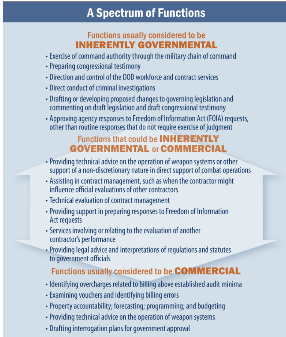
Figure I. Categorization of Functions as Inherently Governmental or Commercial